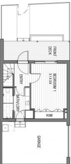
GROUND FLOOR (SITE PLAN)

The floor plans are not to scale - measurements are indicative and in metres. Plans should not be relied on. Interested parties should make their own enquiries.